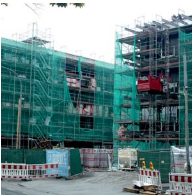
Bau des Labor- und Technologiezentrums der THM

What's going on in Giessen? For you, as an investor, the perspectives offered by a location are crucial. Current building projects and infrastructural development schemes are the best way to document the development and the prospects offered by a city. On account of its increasing population – Giessen is now the largest city in Central Hessen – there are a number of housing construction schemes. New areas for industry and commerce, some of which have been instigated as part of the conversion of former industrial and military areas, are now free. This brochure presents an overview of the most important projects currently being undertaken in Giessen.