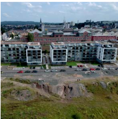
Area "An den Lahnwiesen"