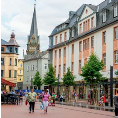
Löwengasse in der Fußgängerzone