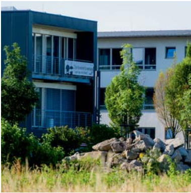
Industrial estate Europaviertel