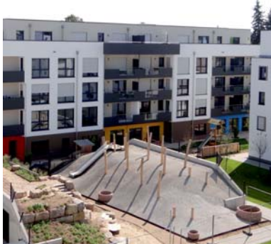
Residential area "Q 16"