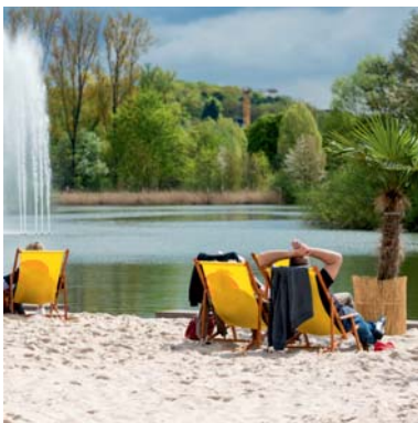
"Strandcafé" in der Wieseckau