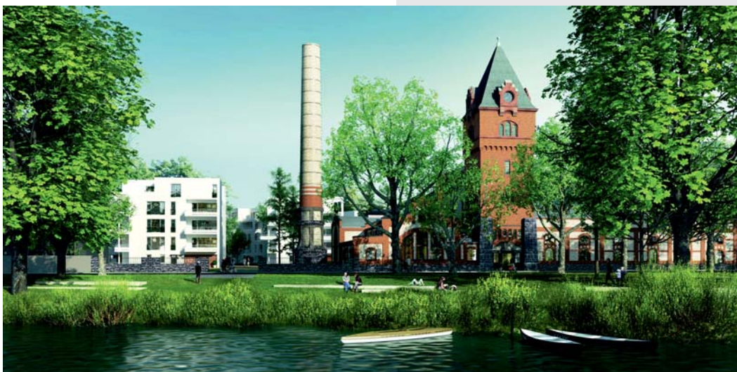
Modus 2.0 and "Alter Schlachthof"

30 building plots for detached houses or two-family houses (private marketing)