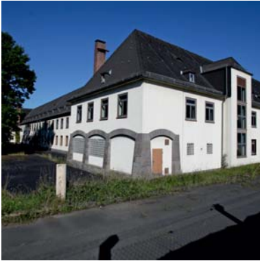
US existing building "Am Alten Flughafen"