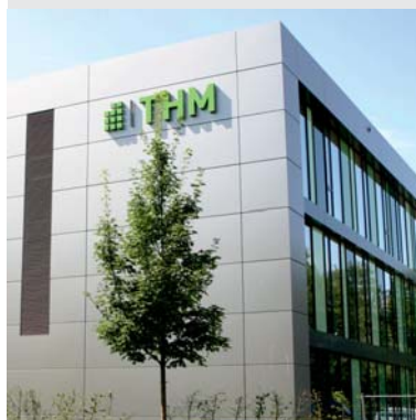
Anwenderzentrum of THM