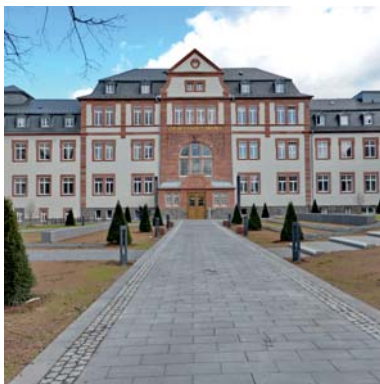
Medical teaching centre, JLU