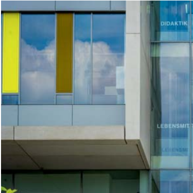
Neubau Chemie, JLU