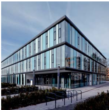
Medical research building, JLU